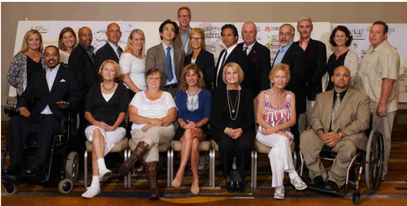
Figure 1. A diverse group of patients, caregivers, advocates, clinicians, outcomes specialists, and researchers were convened for the Patient-Centered Wound Outcomes Summit, July 2012.

The summit was an interactive, professionally moderated set of short presentations and roundtable discussions that established a dialogue and consensus among the participants. The summit began with participants introducing themselves and then naming the single factor they consider most important to patients suffering from a chronic wound. This was followed by two short presentations summarizing the goals of patient-centered outcomes research and what patients with chronic wounds report as important based on semi-structured interviews. Under the direction of the moderator, the assembled group then engaged in a series of discussions that defined a desired future state based on patient-centered outcomes and outlined the barriers that lie in the path of achieving that state. A graphical facilitator captured key points of the discussion, enabling the participants to visually review the content of their conversations. The group then prioritized those barriers according to two criteria: which barriers, if eliminated or reduced, would have the biggest impact on the desired future state of the field; and which barriers would yield to joint-action by multiple stakeholders in the wound healing community. The summit concluded by identifying a set of actions and recommendations that the participants believe would advance the wound care field.